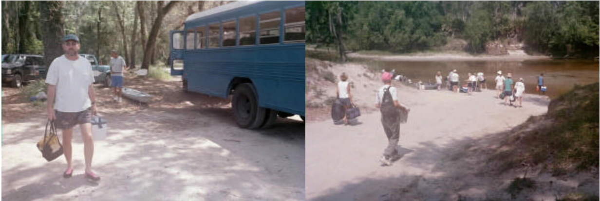
An intrepid canoeist (our daring EGS editor) ready to board the bus to the put-in. The put-in spot.

The day started a little late by the time we assembled all the canoes and traveled in a bus to the put-in spot upriver.